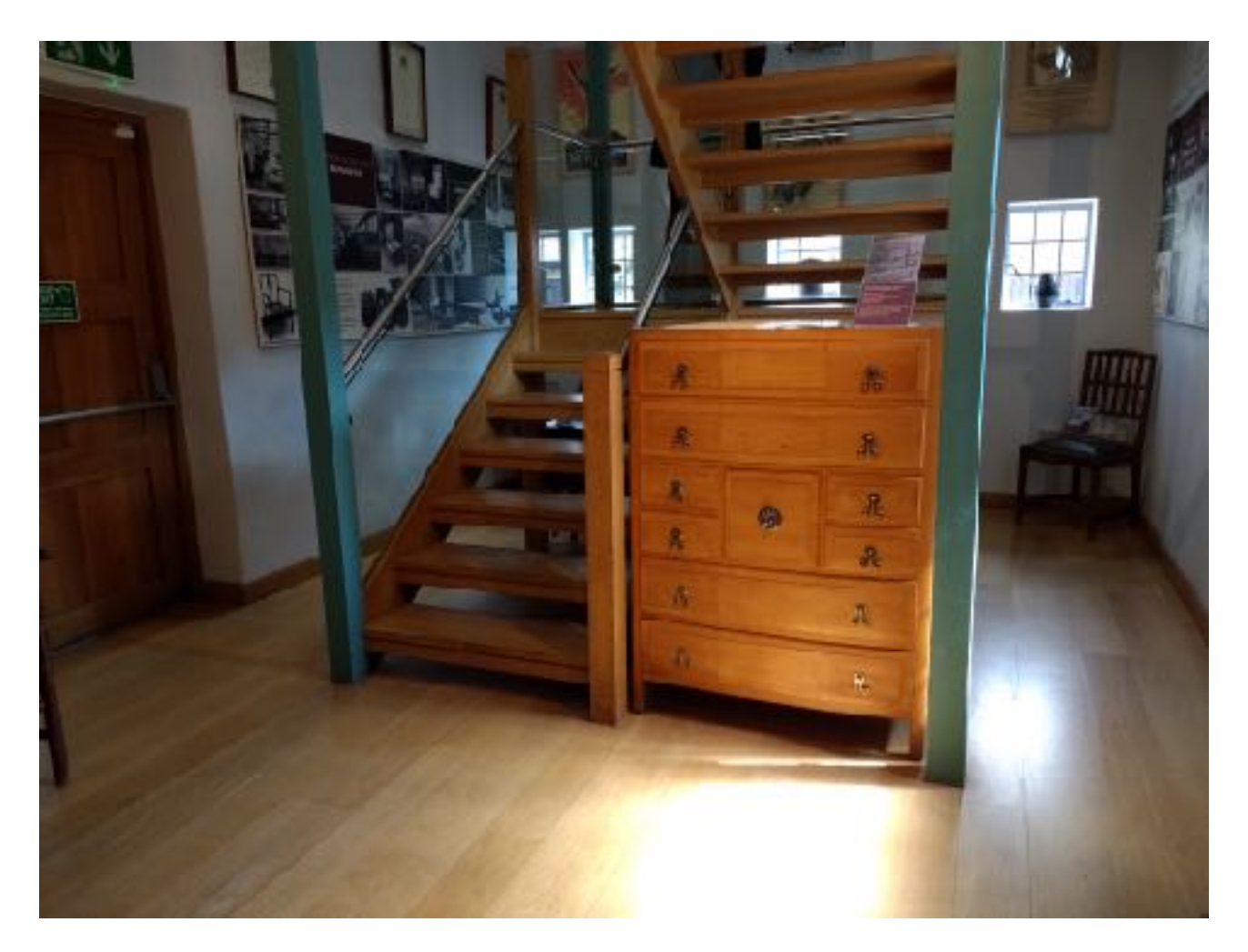
The staircase from the ground floor gallery to the first floor

There is limited space for wheelchairs around the bottom of the stairs, but staff or volunteers will be happy to move objects from this area should visitors wish to look at them more closely. The Museum is looking at ways to improve this space and make it more accessible.