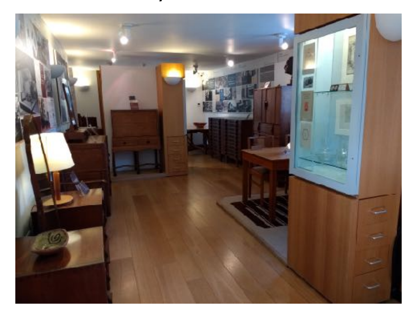
The ground floor gallery space

The ground floor has level access through a glass door which is 99cm wide and there are stairs at each end of the building leading up to the first floor. The stairs have handrails but should not be climbed by visitors with mobility problems.