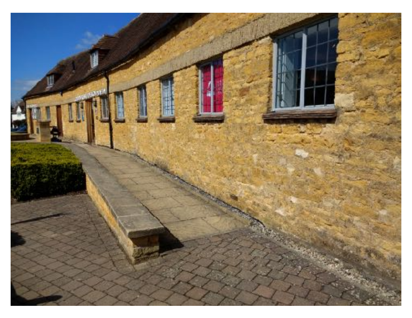
The Museum entrance, via a ramp from Russell Square

There are three public car parks in Broadway, all of which have blue badge holders' spaces, and further details, including charges, can be found here: <a href="http://www.visit-broadway.co.uk/local-services/car-parks.php">http://www.visit-broadway.co.uk/local-services/car-parks.php</a>