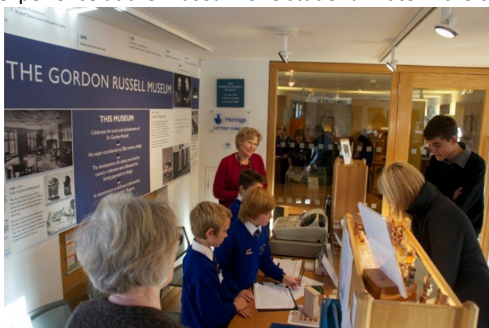
Welcoming visitors to the museum