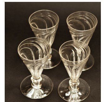
Wrythen glass designed by Gordon Russell

Members of the Forum gathered for a drinks reception in London in December to discuss ways of supporting the Gordon Russell Design Museum. The programme for 2016 is currently being developed and if you wish to find out more please email grdmuseum@gmail.com for an application form - membership is £25 p.a. for two people.