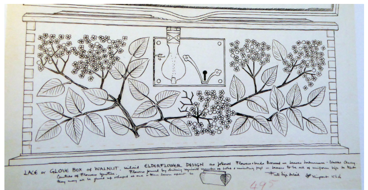
Gordon Russell's design drawing for the unique Glove Box