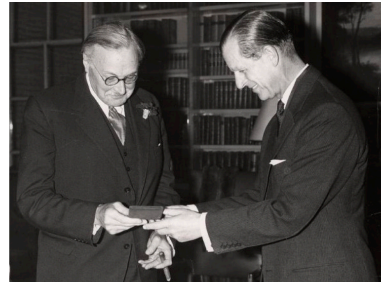
Gordon Russell receiving the Albert Gold Medal for Services to Industrial Design, from the Royal Society of Arts, presented by HRH The Duke of Edinburgh, 1962

Throughout his life Gordon Russell was committed to honest design, superb craftsmanship, quality detailing and a belief in the impact of good design on people's lives. He delivered his message to an international community of both manufacturers and the public alike. His legacy lives on in Britain's vibrant design industry.